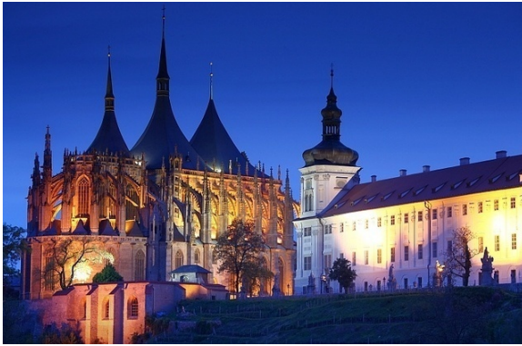
St. Barbara's Church in Kutna Hora