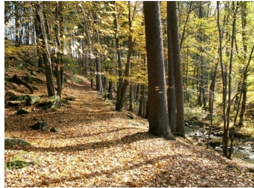
Vrchlice River Trail

Our hike commences at the remnants of Sion Castle, the final bastion of Protestant reformers who opposed the Catholic majority in the 15th century. A scenic journey unfolds through a romantically wooded valley alongside the Vrchlice Creek, with occasional crossings on small wooden bridges. Following a satisfying lunch, we reach Kutna Hora, a medieval gem once in economic, cultural, and political competition with Prague due to its rich silver ore deposits. Our exploration includes the awe-inspiring St. Barbara's Church, Baroque statues at the colossal Jesuit College, the monumental Gothic St. James's Church, and the Gothic Stone House adorned with rich decoration. Delving into history, we visit the Italian Court to learn about minting and explore an adit once employed for silver ore extraction. The tour also encompasses a visit to the Cistercian monastic church and the eerie Sedlec Ossuary, known for its unique artistic decorations crafted from bones and skeletons.