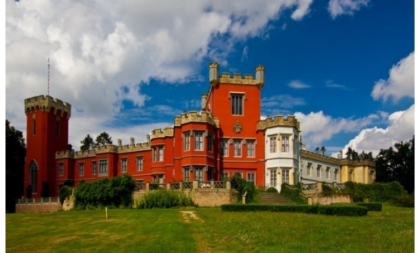
Chateau in Hradek u Nechanic

Our morning transfer brings us to Nechanice, a village renowned for its fairytale chateau, now a national cultural monument. This impressive summer residence of Count Harrach, constructed in the romantic Tudor Gothic style, showcases the Count's wealth and power through its richly decorated interior and exquisite furnishings. A guided tour leads us through the dining room, library, Count and Countess's suites, picture gallery, guest and family chambers, sacristy, and St. Anne's Chapel, offering a glimpse into the nobility's lifestyle. In the afternoon, we embark on a hike through the gently undulating foothills of the Giant Mountains, passing picturesque wooden houses in the Belohrad Spa. A gentle ascent leads to the summit of Zvicina Hill, where we savor a refreshing glass of beer and absorb panoramic views from the lookout tower of the Rais Chalet. A short transfer then takes us to our hotel in the historic town of Jicin.