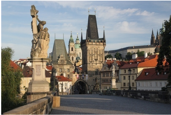
Charles Bridge in Prague