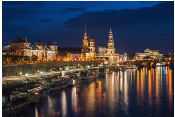
Dresden skyline at night

Embark on a short transfer to the nearby town of Terezin, a bastion fort constructed by Emperor Josef II named after his mother Maria Theresa in 1780. This military fortress later repurposed by the Nazis as a Jewish concentration camp during World War II. Now serving as a Memorial, it honors the victims of Nazi persecution in former Czechoslovakia. After lunch, we take a short transfer to Dresden. This "Florence on the Elbe" boasts a rich cultural heritage, highlighted by the stunning baroque architecture of the Zwinger Palace and the reconstructed Frauenkirche, a symbol of resilience after WWII. The Semperoper Opera House, renowned for its world-class performances, and the extensive collections in the Green Vault reflect the city's artistic legacy. We take a stroll along the picturesque Brühl's Terrace, offering scenic views of the Elbe River, and enjoy the historical splendor. After the tour, we check in at our hotel and wrap up the day with a delightful farewell dinner.