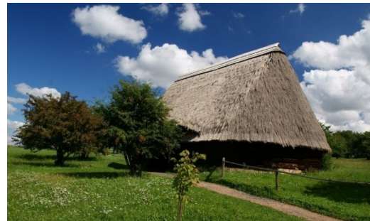
Open-Air Museum in Kurim

After breakfast, we embark on a short drive to Pruhonice, where we indulge in a delightful walk through the expansive Pruhonice Park – a UNESCO site and a significant landscape element in Europe. Established by Count Silva-Tarouca in 1885 during the peak of landscaping style, this park is a paradise for nature lovers. As we stroll, we encounter a diverse array of plants and trees, including magnolias, rhododendrons, azaleas, big-leaf linden trees, Alaska cedars, Japanese orixas, tulip trees, Serbian spruces, copper beeches, bald cypresses, snake branch spruces, and more. The free arrangement, typical of the park, features a harmonious interplay of woody plants, trees, shrubs, meadows, lakes, and meandering streams, all