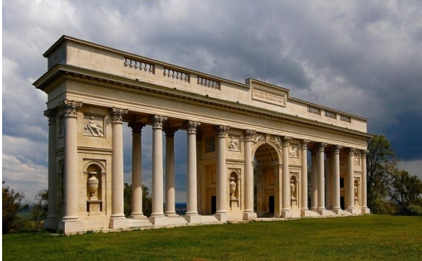
Classicist Colonnade in Valtice-Lednice