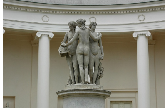
Three Graces in Valtice-Lednice Park

Embark on a full-day exploration through a picturesque landscape park, adorned with 19th-century follies commissioned by the influential Lords of Liechtenstein. This area, nestled between the charming towns of Valtice and Lednice, was meticulously transformed by the lords into the "Garden of Europe," a testament to their opulence and splendor. Begin at a classical colonnade atop the Rajsna hill, offering breathtaking views of rolling hills and vineyards, before descending to Valtice. Admire the grand Liechtenstein Chateau, then continue through pine woods to Diana's Temple, a classical arch-shaped hunting lodge. Pass by St. Hubert Chapel, dedicated to the patron saint of hunters, and the Temple of the Three Graces with allegorical statues of Sciences and Muses. Reach the majestic Lednice Chateau, formerly Liechtenstein's summer residence, and wander through its gardens and artificial lakes with clusters of native and exotic tree species. Explore the Moorish Revival Minaret, an observation tower. Conclude the day with an evening of wine tasting accompanied by live traditional dulcimer music.