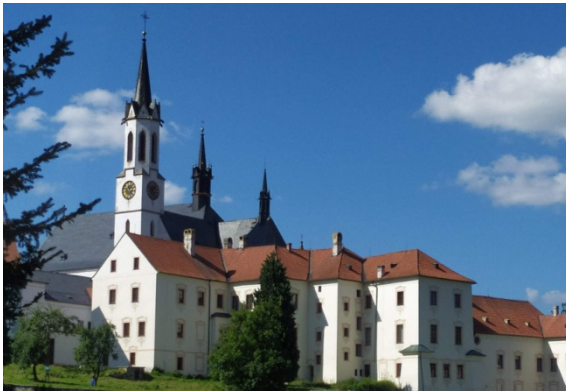
Cistercian Monastery in Vyssi Brod