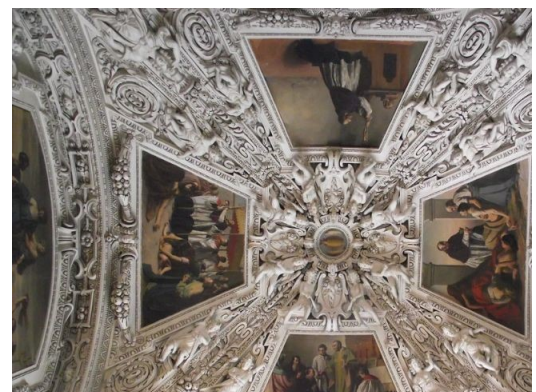
Divine elegance of Salzburg Cathedral's vault

Embark on a captivating city tour featuring Mirabell Palace and Gardens, a Baroque masterpiece renowned for its stunning floral arrangements and the iconic Pegasus Fountain. Navigate the medieval streets of the Old Town, where the grandeur of Salzburg Cathedral with its impressive dome dominates the cityscape. Venture to Hohensalzburg Fortress to enjoy breathtaking views of Salzburg's panoramic