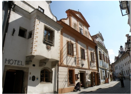
Renaissance houses in Cesky Krumlov

Embark on a guided tour of Cesky Krumlov's extensive castle, the second largest in the country, showcasing diverse architectural styles spanning five centuries. Explore the oldest surviving Baroque court theater, complete with original stage machinery, scenery, and props. In the castle grounds, cross an arched bridge over a deep ravine to discover a large Rococo garden featuring neat pathways, geometric flowerbeds, branching trees, and a fancy cascade fountain adorned with water deities. Enjoy the remainder of the day at your leisure, strolling through the winding, cobbled streets adorned with well-preserved Renaissance and Baroque buildings. Explore the charm of quaint shops and cozy taverns, immersing yourself in the unparalleled ambiance of the city. Allow the authentic atmosphere, reminiscent of four centuries past, to captivate you as you explore Cesky Krumlov, uncovering hidden gems and historical treasures that contribute to the city's unique charm.