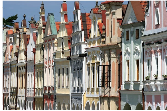
Renaissance houses in Telc

Embark on a transfer to Podyji National Park, where we will hike through a near-natural forest along the Dyje River, surrounded by communities of deciduous trees. The park's unique location on the boundaries of Southern and Central European habitats results in a rich diversity of plant and animal species concentrated in a relatively small area. Explore the natural features of the park, including a captivating stretch of the Dyje River with intriguing meanders. During a guided tour of the medieval border castle ruins, marvel at the spectacular views of the river snaking through the gorge below. Arrive close to the Austrian border to witness remnants of the infamous Iron Curtain, gaining insights into the country's communist past. Conclude the day with a short transfer to our hotel in Telc, a charming town with a unique large square featuring well-preserved Renaissance and Baroque houses, evoking the ambiance of a film set.