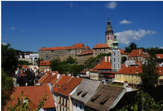
Baroque Library in Vyssi Brod