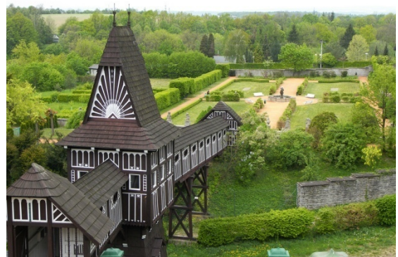
Castle gardens in Nove Mesto

Embark on a morning hike through the Eagle Mountains, exploring the formidable military structures of the Czechoslovak fortification system. In the prelude to World War II, Czechoslovakia constructed an intricate defensive system along its borders, rivaling the more renowned Maginot Line in allied France. The Czechoslovak Wall, though less celebrated, boasted state-of-the-art fortifications surpassing its French counterpart in various aspects. Our trek takes us past infantry bunkers, artillery blockhouses, and into the intricate underground tunnels of the Dobrosov Stronghold. Discover the local people's enthusiasm and readiness to defend their homeland as we delve into the labyrinth. Enjoy a panoramic view of the hilly landscape from Jirasek's lookout tower before a gradual descent to the Metuje River valley. Culminate the day at the charming main square of Nove Mesto, surrounded by gabled Renaissance houses and dominated by a lavishly furnished aristocratic palace with a stunning Italian-style garden. Conclude with a transfer to our hotel in Rychnov.