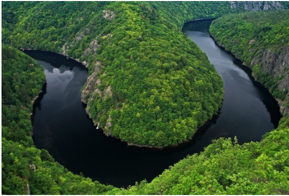
Meandering Dyje River