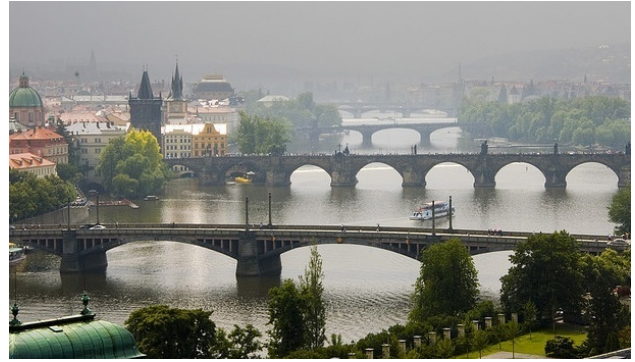
The Moldau River in Prague

After breakfast, we embark on a journey through Prague, the captivating capital of the Czech Republic. Our exploration commences at the iconic Prague Castle, an expansive complex boasting the monumental St. Vitus Cathedral, the intricate stone vaulting system of Vladislav Hall, and the charming Golden Lane with its picturesque little houses, all set against a backdrop of awe-inspiring panoramic views of the city. As we descend towards the Lesser Quarter, discover imposing aristocratic palaces, enchanting gardens, and the whimsical Baroque architecture of St. Nicholas Cathedral. Following a delightful lunch, we traverse the Moldau River via the Charles Bridge, a medieval masterpiece adorned with statues, leading us to the winding cobbled streets of the Old Town. Here, the Gothic-style Old Town Hall and its astronomical clock, a marvel of medieval engineering, command attention in the fabulous square. Our journey culminates in the Josefov district, Prague's Jewish Quarter, where historic synagogues and the Old Jewish Cemetery invite exploration. After the city tour, we transfer to our hotel in the Bohemian Paradise. Overnight: Jicin