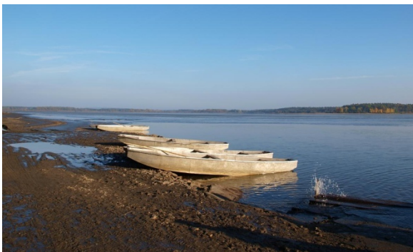
Trebon Lake District