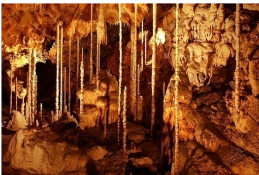
Dripstones in Punkva Caves