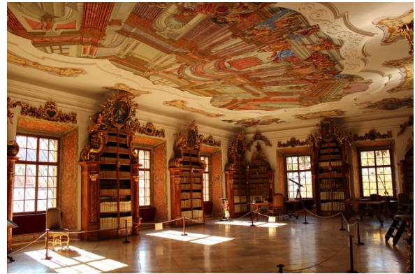
Intricate frescoes in Baroque library

Embark on a delightful short drive to delve into the natural wonders of Sumava National Park. Ascend a hill adorned with Stations of the Cross, offering not only a scenic journey but a spiritual experience. Upon descending alongside the tranquil Wolfgang waterfalls, you will find yourself at the doorstep of the Cistercian Monastery in Vyssi Brod. A guided tour of this venerable institution, founded in 1259, unveils its Gothic architecture, and the visit extends to a stunning Baroque library with an impressive collection of books. The picture gallery, adorned with religious art, adds another layer to the rich cultural tapestry of the monastery. Nestled along the picturesque Vltava River, this monastery stands as a cultural and historical gem, resonating with centuries of spiritual significance. Following this immersive experience, we transfer to our hotel in Salzburg, anticipating further exploration of the city's charm and history.