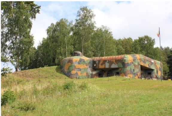
Czechoslovak Wall in Dobrosov