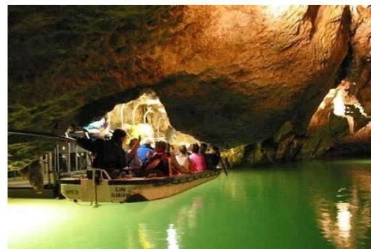
Boatride in Punkva Caves

Embark on a morning transfer to Moravian Karst for a scenic hike in the canyon, shaped by the Sloup Brook's waters, a tributary of the subterranean Punkva River, forming an extensive cave system with underground passageways, domes, and abysses spanning around 5 miles. Enjoy a woodland stroll towards the renowned Macocha Abyss, Central Europe's deepest sinkhole, offering a daring view from the highest edge to the abyss's bottom. Descend into the Punkva Caves to witness the natural wonders