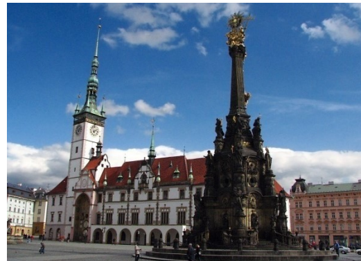
Holy Trinity Column in Olomouc

Commence the day with a morning transfer to Litomysl, a UNESCO World Heritage site and the birthplace of the renowned Czech composer Bedrich Smetana. A guided tour of the Renaissance chateau will unveil charming sgraffito decorations, stately halls adorned with stylish furnishings, an impressive dining room, and a unique Baroque theatre. Enjoy a leisurely stroll through the gardens of the Piarist Monastery and along the main square, where historical buildings boast elaborate facades. After a delightful lunch, we proceed to Olomouc, another UNESCO site with immense historical significance and vibrant atmosphere. Wander the patterned cobblestone streets, passing Baroque and Gothic churches, imposing palaces, and iconic public fountains featuring ancient Roman gods and heroes. The main square, a picturesque scene, is dominated by the celebrated Holy Trinity Column, the most monumental of its kind in Central Europe. Conclude the day with dinner at a fancy restaurant.