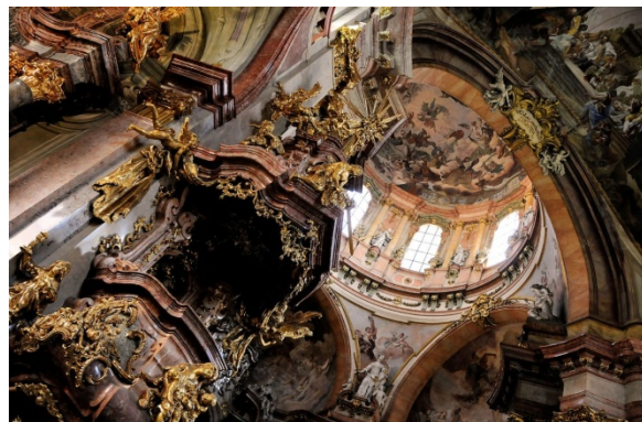
Opulent decoration of St. Nicholas' Church