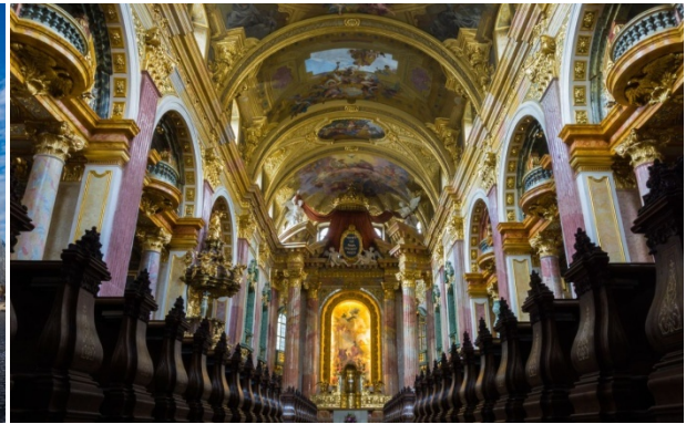
Stunning Baroque interior of the Jesuit Church

After breakfast, embark on a captivating city tour of Vienna with a local guide. Begin at the iconic St. Stephen's Cathedral, a marvel of Gothic architecture. Leisurely walk through Vienna's city center, immersing yourself in its historic charm as you meander through the enchanting streets of the Innere Stadt, absorbing the vibrant atmosphere. Explore the grandeur of the Hofburg Palace, once home to the Habsburgs, and stroll along the bustling Graben shopping street. Marvel at the Kunsthistorisches Museum from the outside, appreciating its architectural splendor. Delve into Vienna's musical heritage at the Mozarthaus Vienna, the former residence of Wolfgang Amadeus Mozart. Take in the baroque splendor of Maria Theresien Platz, surrounded by impressive buildings. Spend the remainder of the day at your leisure, immersing yourself in the enchanting atmosphere of Vienna, whether indulging in local shopping or relaxing at a traditional Viennese café. In the late afternoon, enjoy a scenic ride to Mikulov, a historic town and a renowned center of wine-growing located right on the Czech-Austrian border.