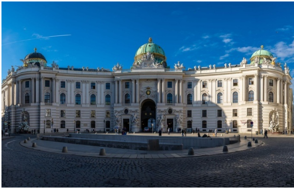
Grandios Hofburg Palace