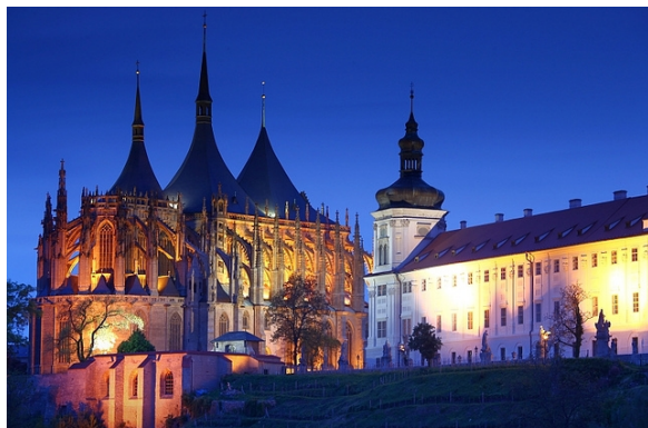
St. Barbara Church, a masterpiece of Gothic architecture

Embark on a morning transfer to Litomysl, a UNESCO World Heritage site and the birthplace of the illustrious Czech composer Bedrich Smetana. A guided tour of the Renaissance chateau reveals enchanting sgraffito decorations, grand halls adorned with stylish furnishings, an impressive dining room, and a unique Baroque theatre. Following a leisurely stroll through the gardens of the Piarist Monastery and along the main square with its historical buildings boasting elaborate facades, indulge in a delightful lunch. Take a short drive to Kutna Hora, a stunning and inspiring medieval city. Thanks to its great deposits of