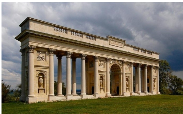
Classicist Collonade in Valtice-Lednice