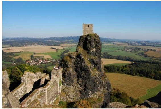
Formidable Trosky Castle

Commence the day with a brief transfer to the serene Bohemian Paradise, a region aptly named for its captivating landscapes featuring rolling hills, imposing rock formations, and commanding castles. Immerse yourself in the enchanting Prachov Rocks, where the unique shapes of towering sandstone spires and majestic gorges will captivate your senses. The rocks originated millions of years ago during the Cretaceous period and today are a testament to the intricate interplay of natural forces over geological time, creating a landscape of exceptional beauty and geological interest. Explore beneath the atmospheric ruins of Parez Castle, once a notorious stronghold of ruthless highwaymen, and savor a delightful picnic lunch by a tranquil lake. Ascend to the summit of Trosky Castle, majestically perched on two imposing basalt rocks, offering an unparalleled panoramic vista of the picturesque surroundings. Conclude the afternoon with a scenic drive back to our hotel in Kutna Hora.