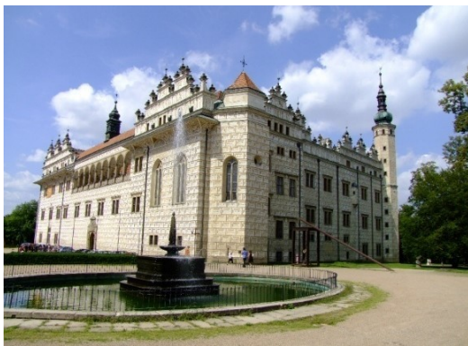
Majestic Renaissance Chateau in Litomysl