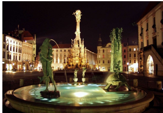
Holy Trinity Column in Olomouc

Embark on a morning transfer to Moravian Karst and explore the stunning Macocha Abyss, Central Europe's deepest sinkhole, providing a breathtaking view from the highest edge down to the abyss's bottom. Descend to the bottom and enter the caves where the subterranean Punkva River has shaped an extensive cave system with underground passageways, domes, and abysses. Marvel at the natural wonders of dripstone formations, including artistic stalactites, stalagmites, draperies, flowstones, and columns, quietly growing for 25-30 million years, unseen until the late 19th century. The guided tour concludes with a romantic water cruise on the subterranean Punkva River. After lunch, enjoy a short tranquil woodland stroll through the Suchy Zleb canyon, featuring unique rock formations. Our journey continues to Olomouc, another UNESCO site with rich historical significance and a vibrant atmosphere. Traverse the patterned cobblestone streets, passing by Baroque and Gothic churches, imposing palaces, and iconic public fountains featuring ancient Roman gods and heroes. The picturesque main square is dominated by the celebrated Holy Trinity Column, the most monumental of its kind in Central Europe. Cap off the day with a splendid dinner at a distinguished restaurant.