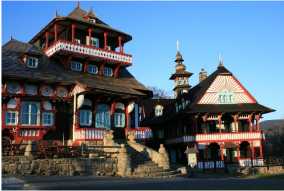
Stylish Libusin Restaurant at Pustevny