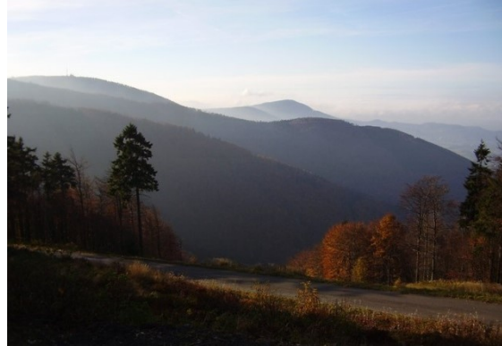
Enchanting panorams of the Beskyd Mountains

Embark on a scenic one-hour drive to Roznov pod Radhostem, a former climatic resort serving as a gateway to the Moravian-Silesian Beskids. Explore the Wallachian Open-Air Museum, delving into the interiors of picturesque wooden houses and gaining insights into the lifestyles of people from bygone centuries. Indulge in a delectable lunch at the stylish Libusin restaurant, blending Art Nouveau with local folk architecture. Embark on a leisurely panoramic hike along a mountain ridge, immersing yourself in the captivating scenery of the Beskids. Conquer the summit of Radhost, a legendary mountain once dedicated to the Pagan god Radegast and later adorned with a wooden chapel in honor of Byzantine missionaries Cyril and Methodius in 1898. Conclude the day with a return journey to Olomouc, where the evening unfolds with a delightful dinner at an elegant restaurant.