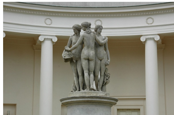
Three Graces in Valtice-Lednice Park

Embark on a day of exploration by immersing yourself in the lavish interiors of the Lednice Chateau, a splendid Tudor Gothic masterpiece that once served as the summer retreat for the influential House of Liechtenstein. Positioned between the charming towns of Valtice and Lednice, this area has been transformed into the "Garden of Europe," showcasing the lords' extravagant opulence. Wander through the chateau gardens and artificial lakes, adorned with