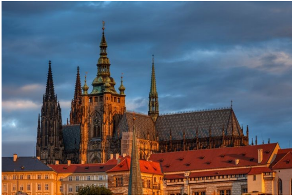
Formidable Prague Castle, the largest in the World