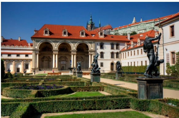
Gardens of the Wallenstein Palace in Prague