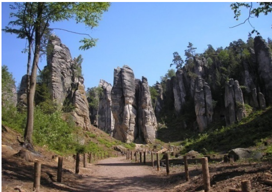
Intricate labyrinths of Prachov Rocks