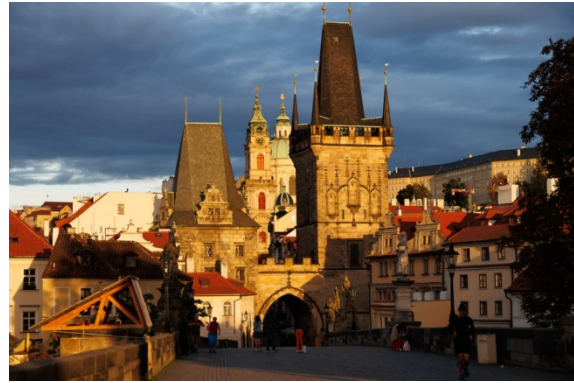
Majestic Charles Bridge from the 14th century

After a hearty breakfast, embark on a brief journey to Prague, the enchanting capital of the Czech Republic. Initiate the city tour at the iconic Prague Castle, a vast complex showcasing the monumental St. Vitus Cathedral, the intricate stone vaults of Vladislav Hall, and the charming Golden Lane, adorned with picturesque little houses, all against a backdrop of breathtaking panoramic views of the city. Following a delightful lunch, cross the Moldau River to Josefov district, Prague's Jewish Quarter, where historical synagogues and the Old Jewish Cemetery beckon exploration. Our journey concludes with a stroll through the winding cobblestone streets of the Old Town. Here, the Gothic-style Town Hall and its astronomical clock, a marvel of medieval engineering, captivate attention in the fabulous square. After the city tour, check in at your conveniently located hotel and spend the remainder of the day at your leisure.